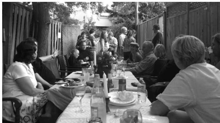
Make new friends at a street party.

I'm not talking about patios again. Grab yourself some decadent takeout (my pick is a cheeseburger and fresh-cut fries from Flame Shack), grab a bench at a nearby park and dig in. Because even the best food always tastes better outdoors.