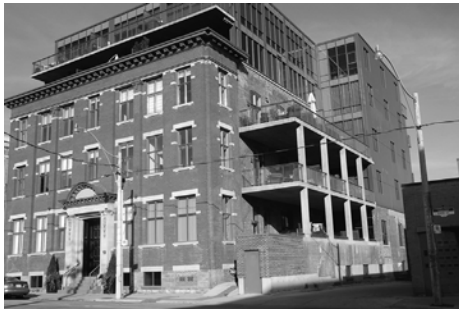
Vinegar Lofts 19 River Street Built in 2008 by Streetcar Developments No. of units: 38

Corktown is undergoing an immense building boom, which is great for people moving into the area as they have more options than they have ever had. Socrates gives his thoughts on some of the alternatives.