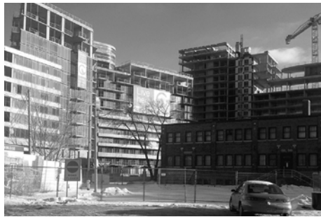
Canary Park Condominiums Front Street + Bayview Avenue Occupancy 2016, to be built by Dundee Kilmer & Waterfront Toronto No. of units: 437

This boutique project is an outstanding example of how developers can keep the spirit of Corktown's history while introducing architectural depth and character to the neighbourhood.