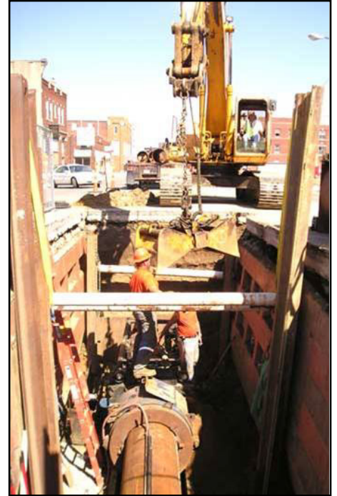
Example tunnel shaft

Every effort will be made to reduce inconveniences. The City appreciates your understanding and co-operation.